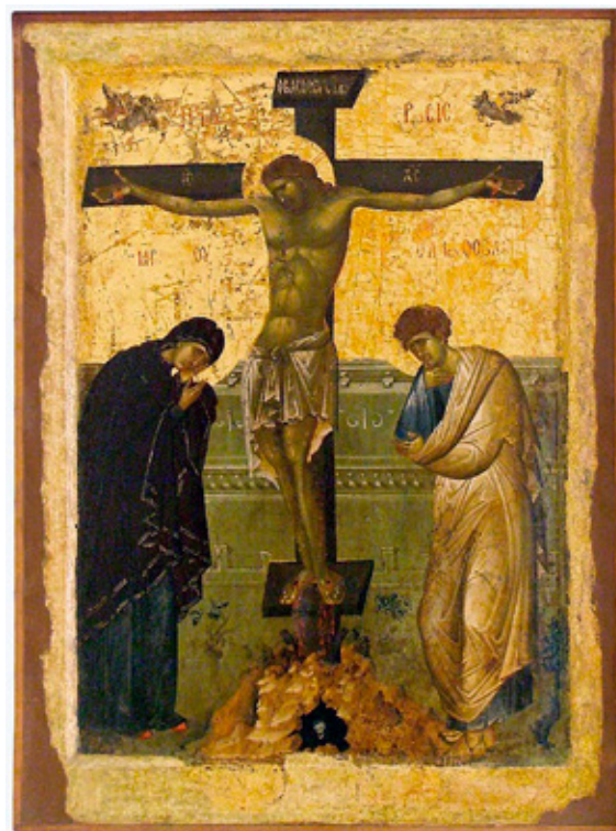
10 The Crucifixion , early 14th C., processional icon (on the reverse, Virgin Psychosostis ), inv. no. 11

10. Распятието, ран 14 век, процесиска икона (на другата страна Богородица Душеспасителка), инв. бр. 11