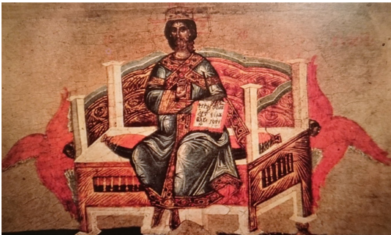
18. Christ tsar as part of Diesis, church of Holy Archangel, Kučevište, late 16th C., Etnographic Museum Belgrade, inv. no 1314

18. Христос Цар, Деизис, црква Св. Арханђели, Кучевиште, доцен 16 век, Етнографски Музеј во Београду, инв. бр 1314