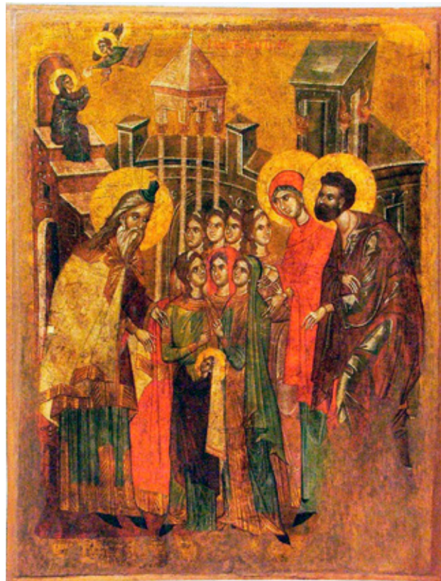
6. The Presentation of the Virgin in the Temple, 2/2 of 14 th C., processional icon (on the reverse, the Mother of God Peribleptos), inv. no. 4,

6. Воведение на Богородица во храмот, 2/2 14 века, процесиска икона (на другата страна Богородица Перивлепта), инв. бр. 4