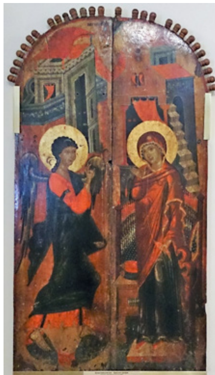
12 The Annunciation-Royal Doors, middle of 15th C., Church of the Mother of God village of Botun near Ohrid, inv. no. 320/321

12. Благовештение, Царски двери, средина на 15 век, црква св. Богородица во селу Ботун кај Охрид, инв. бр. 320/321