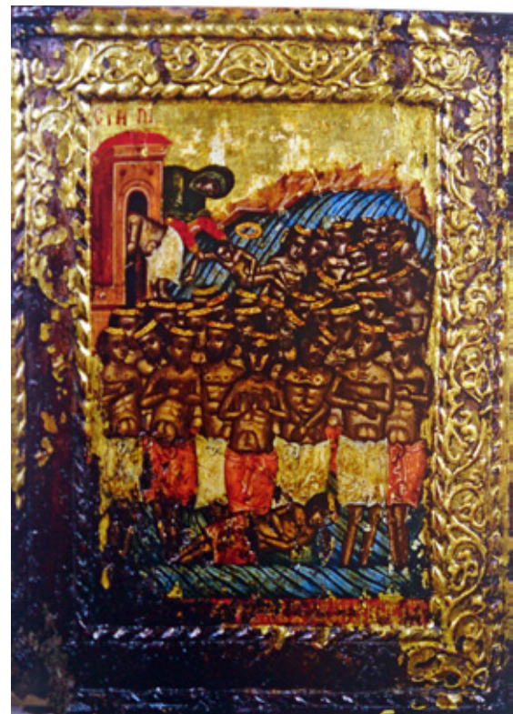
4. Holly Forty Martyrs , Museum of Macedonia, 1/4 of the 17 th C., inv. no.72

3. Хомилија на Богородица на Јаков Кокинова-фоса , 1/2 12 века, Национална Библиотека, Париз