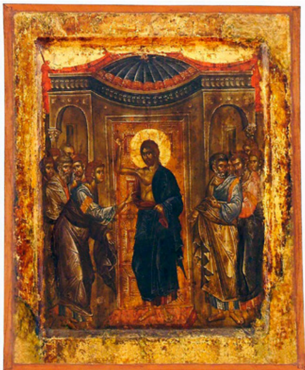
9. The Incredulity of Thomas , early 14th C., inv. no. 7 9. Томино неверство, ран 14 век, инв. бр 7

within a city under trelobed arch with knotted columns, on his left and right and beneath him there are parts of a palace visible. In Dobreišo Tetraevangelium, National Library of Sophia, 13th C., on the page with St. Marc there is symbolic architecture above him with three arches. The knotted columns with arcades here indicate holiness and importance of the represented figures and are shortened symbolic indication of paradise. 15