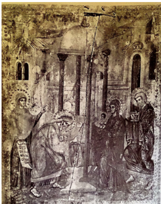
15. The Presentation of the Virgin in the Temple, 1711, painter David from Selenica, monastery of St. Nahum 15. Воведение на Богородица во храмот, 1711, сликар Давид од Селенице, Манастирска црква Св. Наума

to certain parts of the icon, and look like a kind of comic commentary (Annunciation icon, Tretyakov Gallery). Capitals with masks continued to be used later on (16 th C. paintings in the churches of the monasteries in Nerezi, Slepče etc.).