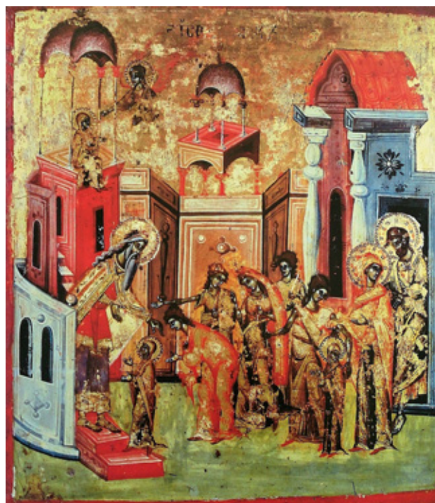
16. The Presentation of the Virgin in the Temple, 1730, painter David from Selenica, Bitola 16. Воведение на Богородица во храмот, 1730, сликар Давид од Селенице, Битола

The images of buildings, parts of cities or church furniture with baldachin from the post byzantine period show different parts of cities that are modern scenery and show the new trend of representing modern architecture. The number of ciboria used, many details, intensive colors of building facades plus various church models are the main differences when architecture is concerned. Usually the buildings are oriented in the same direction as the figures in the foreground. There are several icons made by different painters that show remarkable representation of architecture, once part of the iconostasis of Holy Virgin Peribleptos or other Ohrid churches, today exhibited in the Ohrid gallery of icons. Usually the comments and notes regarding these icons were description, stylistic notes and explanation of iconography. Yet, equally important part of the icon is the architectural context of the painted figure or feast. It has been scholarly valued in the last decade by professors Slobodan Ćurčić, Alexei Lidov, and Robert Ousterhout.