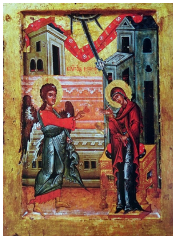
14. Annunciation, painter Jovan Teodorov from Gramosta, 1535, inv. no. 191

13. Распятие, мајстор Михајло, 19 век, црква Богородица Болничка