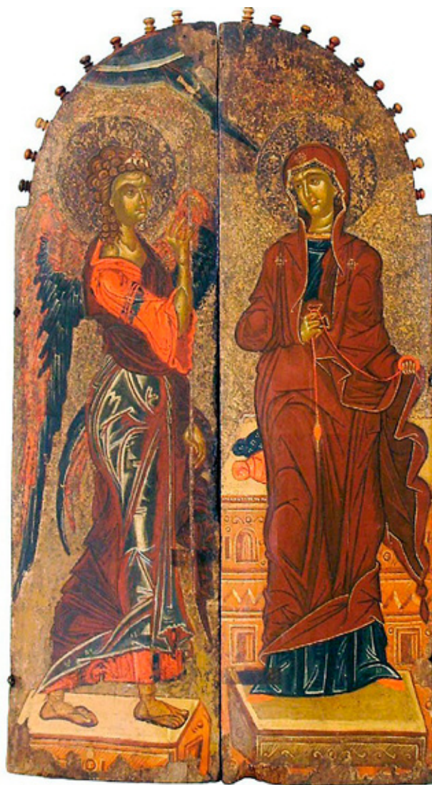
19. The Annunciation-Royal Doors , end of 14 th C., Church of Ss. Constantine and Elena in Ohrid, inv. no. 97