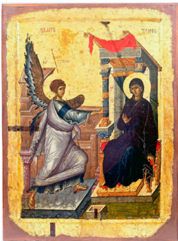
7. The Annunciation, early 14th C., processional icon (on the reverse Holy Virgin Psychosostria), inv. no. 10

7. Благовещение, ран 14 век, процессиска икона (на другата страна Богородица Психосострија), инв. Бр. 10