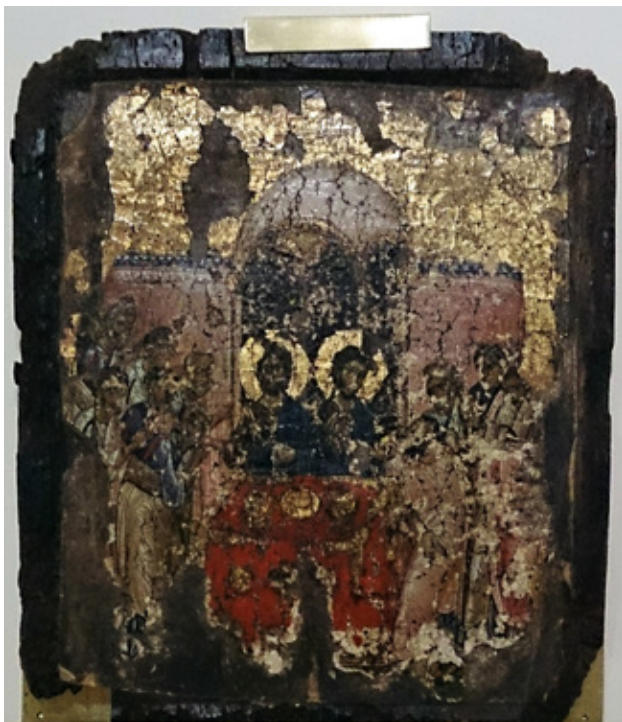
5. The Communion of the Apostles, end of 11 th - early 12 th C., inv. no. 282,

5. Причестувањето на апостолиите, крај 11 - ран 12 век, инв. Бр. 282