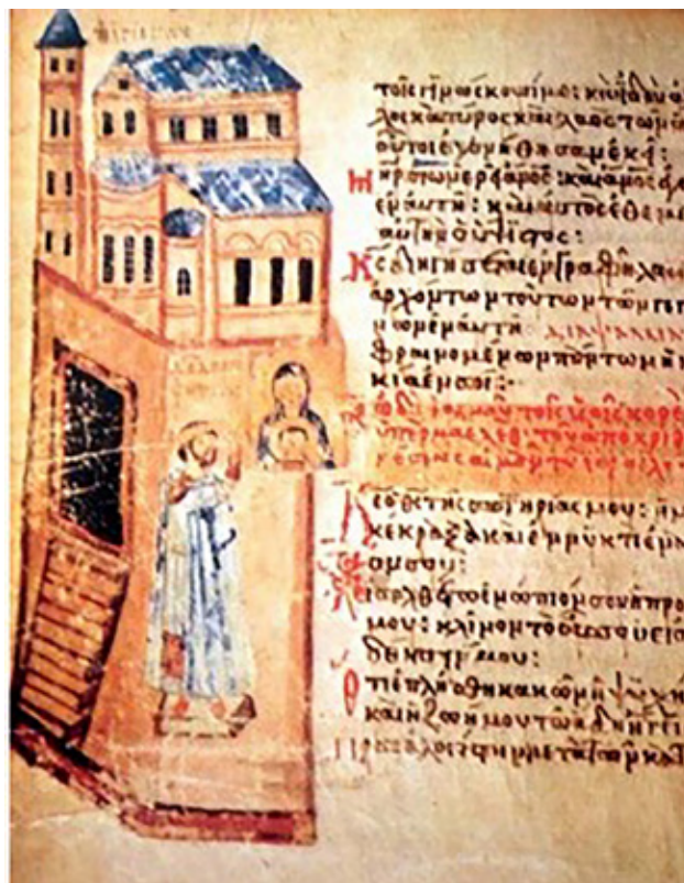
2. Chludov Psalter, mid 9 th C., page no. 86, State Historical Museum, Moscow,

1. Илуминација со претстава на храмот, Ашбурнхам Пентатеух, 7 век, Национална Библиотека, Париз