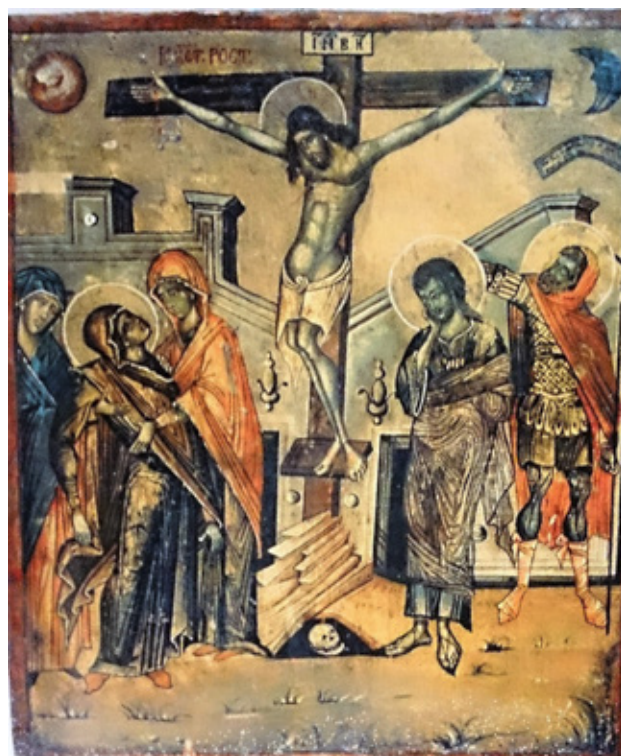
17. Crucifixion , painter David from Selenica, 1739/40

In the background of the central Christ figure with raised right hand, with lateral groups of six apostles is a painted facade of some architectural construction with a two winged ochre door, richly hatched with gold. On both sides there are arches and columns with capitals with volutes that seem to be a kind of porches to the building that develops like niche that shows