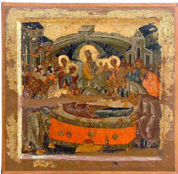
11. The Dormition of the Mother of God, early 14th C., from the Church of St. Nicholas Gerakomia, inv. no. 9

11. Успение Богородичино, ран 14 век, црква Св. Никола Геракомија, инв. бр. 9