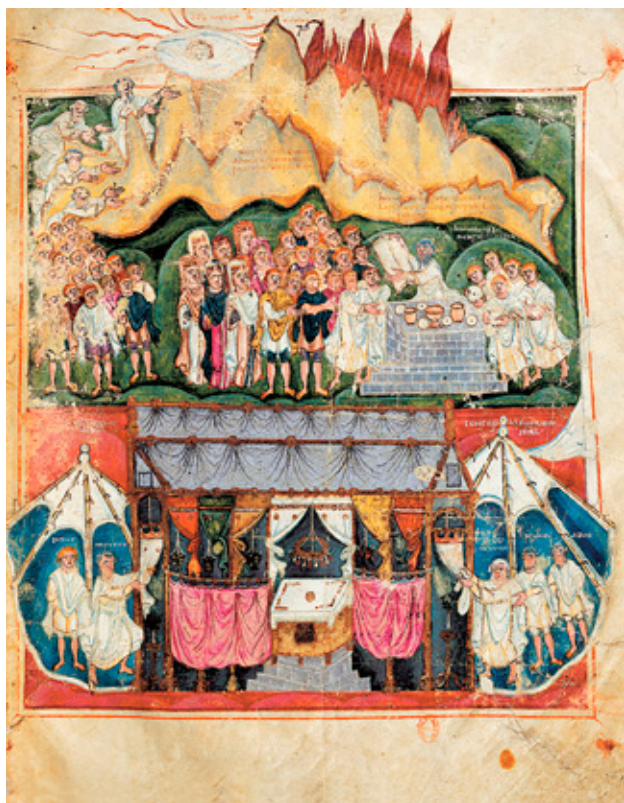
1. Illumination with the image of the temple, Ashburnham Pentateuch, 7 th C., National Library of Paris

1. Илуминација со претстава на храмот, Ашбурнхам Пентатеух, 7 век, Национална Библиотека, Париз