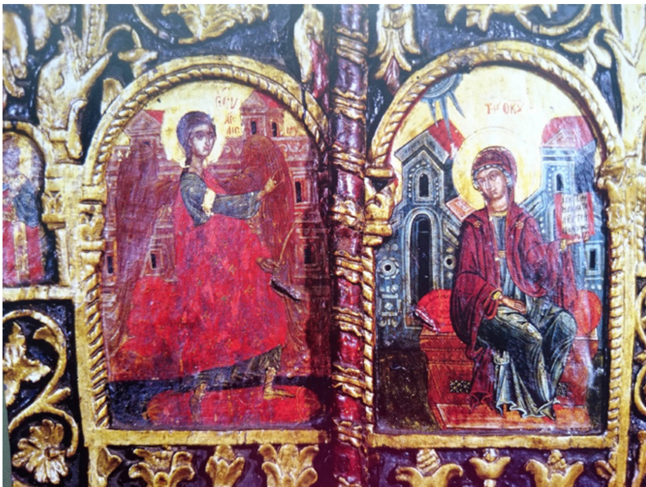
20. The Annunciation-Royal Doors, 18 th C., Church of St Athanasius, Museum of Macedonia, inv. no. 258

20. Благовештение, Царске Двери, 18 век, Св. Атанасије, Долно Водно, Скопје, Музеј на Македоније, инв. бр 258