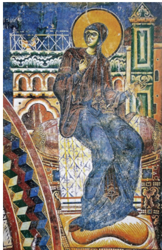
8. Annunciation, detail of Virgin throne and palace behind it, fresco from St. George, Kurbinovo, 1191

7. Благовещение, ран 14 век, процессиска икона (на другата страна Богородица Психосострија), инв. Бр. 10